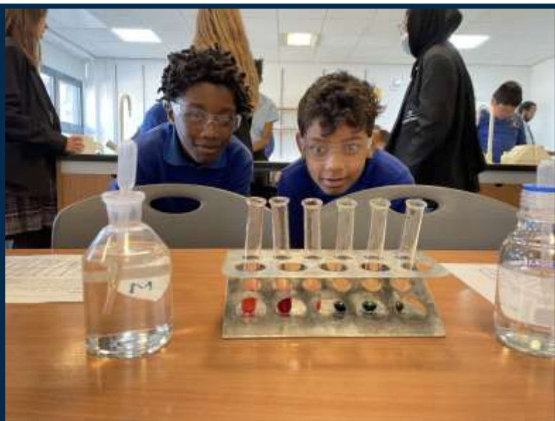
Making a rainbow at Lambeth Academy

Year 6 Class Assembly Starts 9.15 am Prompt 6K Wednesday 17th November 6W Thursday 18th November